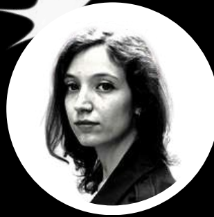
Lucrezia Bariselli Print + Materials